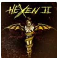
Hexen 2 – Walkthrough

Level 32 The Ancient One — See that rock in the bloody pool? The one with the Anger on it? Notice that your enemy never moves? Just stand a short distance behind the rock, and you're completely shielded. You can even grab the Anger from this side by hopping up onto the rock, then backing off again to your safe spot. Blow him away, and you'll be one happy undead dude. And finished with the game, to boot. Congrats!