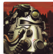
Fallout – Walkthrough