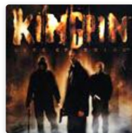
Kingpin: Life of Crime – Walkthrough